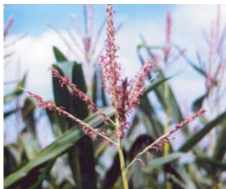
Male Corn flower

The latest ISAAA report (January 13 th 2004) shows that the world-wide cultivation of transgenic plants is soaring, but the European countries are still hesitant about a commitment to the new technologies. A report of the National Center for Food and Agricultural Policy (NCFAP), USA shows that this timid policy may be to Europe's disadvantage.