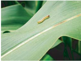
Larva of Corn Borer