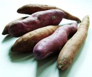
Different varieties of sweet potatoes

anti-GM groups who say she's legitimizing their favourite bogeyman. In this month's featured interview, Wambugu answers those critics and lays out her plan for a more prosperous Africa.